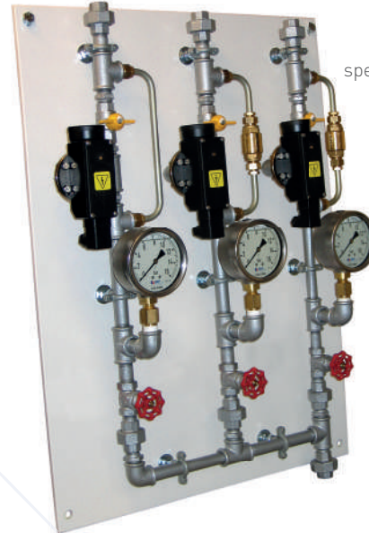
BS5306 style, special configuration, piped drain