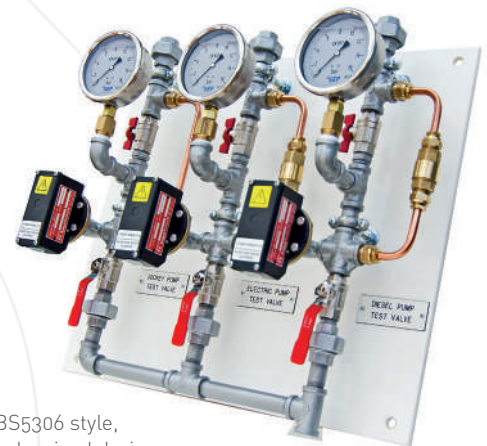
BS5306 style, galvanised drain