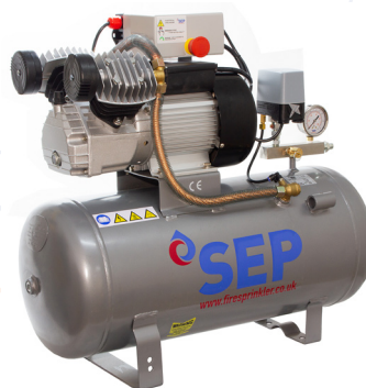
SEP2.2S with 50L air receiver