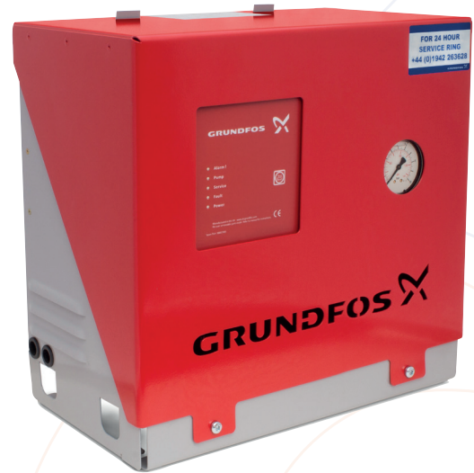
Domestic "CM" Unit